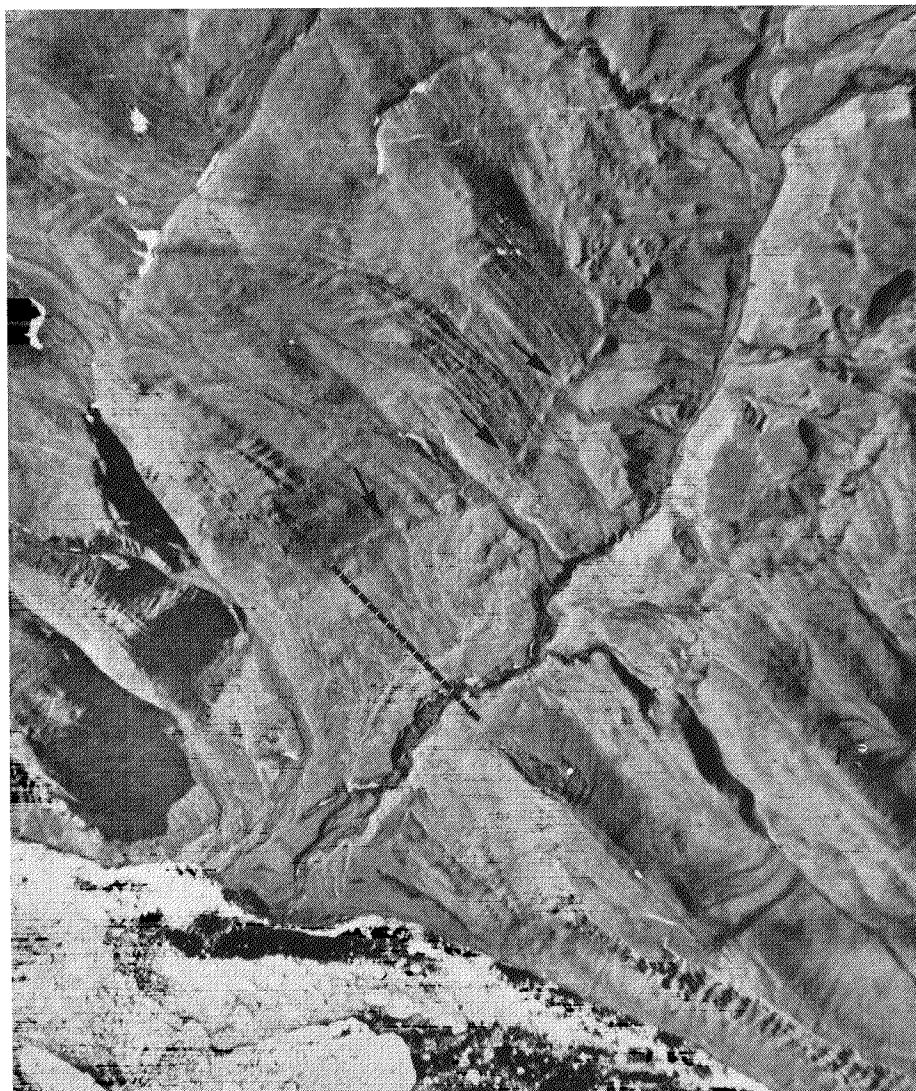
Fig. 2. Air photograph of "Beethoven Valley" showing the horizontal ice-shelf moraines (black arrows) and the approximate grounding line (black circle). Dotted line shows the approximate outer limit of this ice shelf based on morphologic evidence.

The uppermost Ellesmere Island moraines in the interior of Judge Daly Promontory occur at c. 500 m a.s.l. and descend to c. 260 m a.s.l. at the entrance to lower "Beethoven Valley" (Fig. 1). Within 0.5 km of this latter point, a well-developed system of conical kames and lateral moraines descends steeply down-valley to an elevation of 200 m a.s.l., where they become abruptly horizontal for a distance of c. 2 km. Immediately up-slope from these horizontal lateral moraines one encounters a sharp break in weathering characterized by deeply oxidized bedrock, tors, and a sparse distribution of crystalline erratics previously deposited by the Greenland ice sheet. The horizontal moraines are considered to represent the lateral margin of a floating outlet glacier whose grounding line was located at the lowermost sector of steeply sloping lateral moraines up-valley. Vertical and ground-level view of