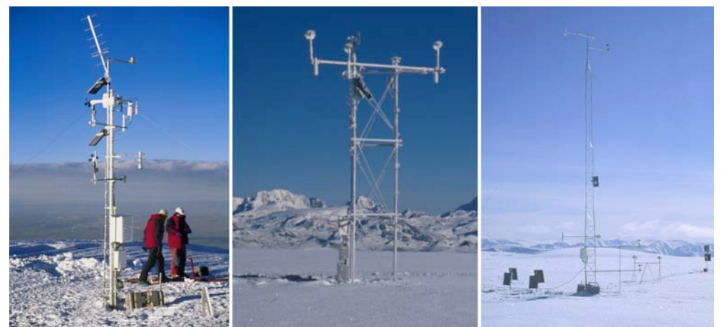
Figure 1: AWS on Sajama (left), Quelccaya Ice Cap (center), and Murray Ice Cap (right).

Four high-elevation AWS sites coincide with locations from which ice core records were obtained. Nevado Sajama is in the Cordillera Occidental of Bolivia (Figure 1, left-hand image; 18^{\circ}06'S , 68^{\circ}53'W and 6542 m), where an ice core was obtained in 1997 (1). Our station operated for four years (2–6). Also in Bolivia, we deployed a station in the Cordillera Real at 16^{\circ}39'S , 67^{\circ}47'W at 6265 m on Nevado Illimani (7) near the site of 1999 ice core drilling (8–10). A new station is currently operating on Quelccaya Ice Cap in Perú (130 56'S, 700 50'W and 5670 m), where long ice cores were drilled in 1983 and again in 2003. In Africa on the Northern Icefield of Kilimanjaro (3°04'S, 37°21'E and 5794 m), an AWS has operated continuously since 2000 (11-16). Our high-latitude site was on the Murray Ice Cap, northern Ellesmere Island ( 81^{\circ}21'N , 69^{\circ}15'W ) at an elevation of 1,100 m. Here, an additional AWS on a 10-meter tower operated seasonally through three summers (Figure 1, right-hand image). Measurements were undertaken at this site to better understand glacier-climate interactions, and areal changes in glacier extent through time (17-19).